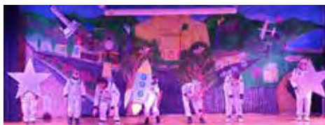
Taking it the stars and beyond, with a blue-light segment that blew everyone away.

The sky was the limit for Kandos Public School students as they danced and sang their way through their whole school performance 'Fly' in September. It was a show that had it all, from an Aboriginal dance group with a wonderful Lyre Bird dance to an amazing rocket man - outer space ensemble with a blue light segment that turned the group into a glowing, pulsing sci-fi experience. Audiences, as always, loved the little kids who were so natural and entertaining. All up, it was a memorable performance from the whole school. Congratulations to the students, teachers and parents who put such a big effort into it. The costumes were colourful and the choreography was exceptional. It was a very enjoyable experience for everyone.