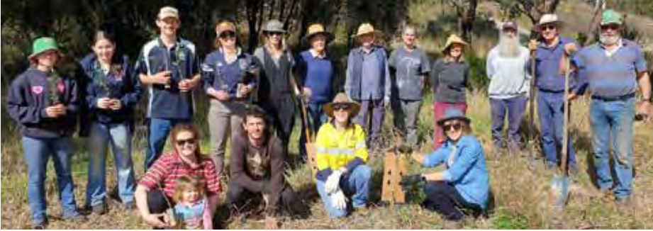
Kandos High School students, volunteers from across the region and Rylstone District Environment Society members planted 200 bottlebrush and tea trees along the Cudgegong River at Rylstone during Bottlebrush Day.

A spokesperson for the group said the aim of these bottlebrush plantings is to increase biodiversity in riverbank vegetation and raise awareness in the community about the importance of foreshore vegetation in preventing erosion, improving water quality and providing habitat for wildlife, including fish. "The Cudgegong River is a small but important part of the Murray Darling System. We've seen a steady improvement of water quality in our local river thanks to these plantings over the years. They also add another attraction for the increasing numbers of tourists who enjoy walking along the river looking at birds or trying to spot a platypus."