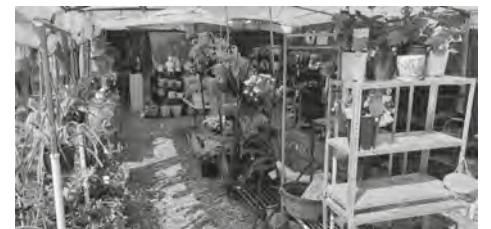
Plants and gifts of all kinds are a feature of Helen's shop. Some of her little painted lizards and frogs would make great Christmas gifts for kids of all ages.