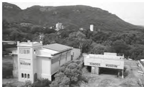
The impressive Kandos Museum with the former cement works in the background is now open for visitors again.

The museum is a showcase of the early history of the industrial town of Kandos, which came into being to produce cement around 1914. Heavy equipment from the nearby cement plant has become a feature of the museum in recent years and visitors are awed at the size and complexity of some of the pieces. Inside, there is also a glimpse of the everyday life of people living in those early times. The museum is open Wednesdays to Sundays from 10am to 4pm.