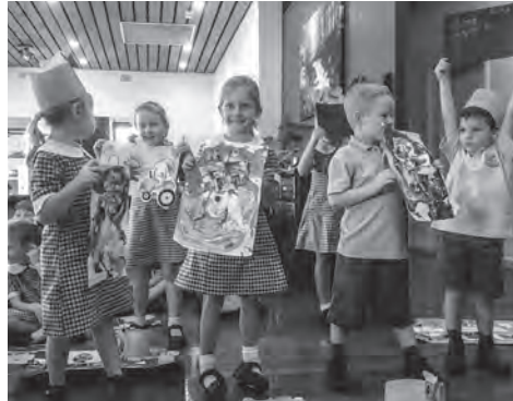
Seniors really enjoyed the colourful art works displayed by Rylstone Public School's Infants class at the Rylstone Seniors Lunch and Award Ceremony.

songs, recite their poems and show their creative art work. Earlier, they met Healthy Harold in the Life Education Van and many had check-ups with the Dental Van ladies. The 20 Days of Kindness was also completed and everyone is very proud of their success and have learnt many new strategies to spread their kindness around.