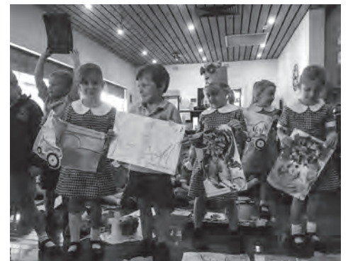
A big thank you to the children from the seniors for a very enjoyable and entertaining visit.