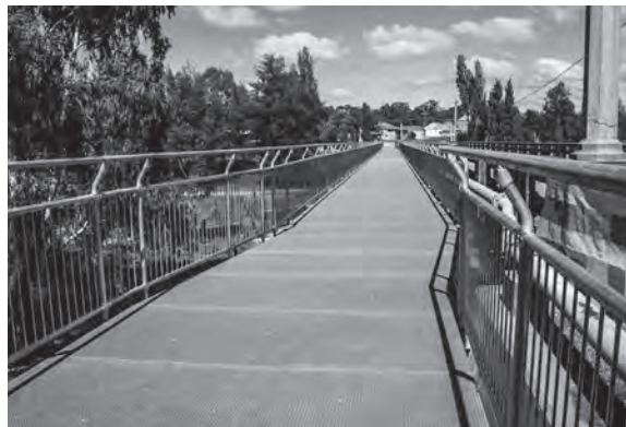
The new pedestrian bridge is looking good. It will be completed and ready to use soon.

The new pedestrian bridge over the Cudgegong River at Rylstone is taking shape.