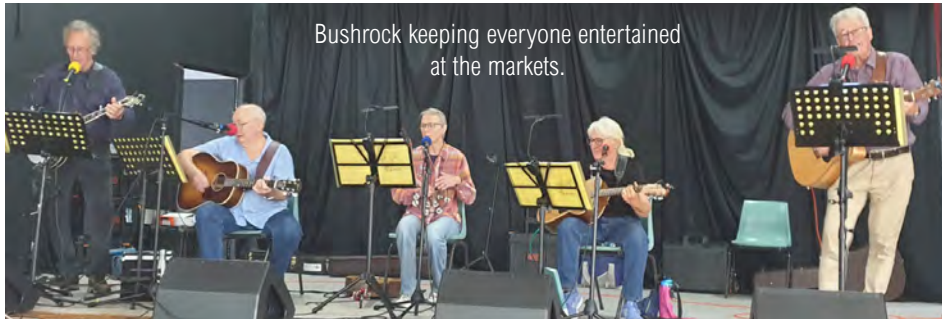
Bushrock keeping everyone entertained at the markets.