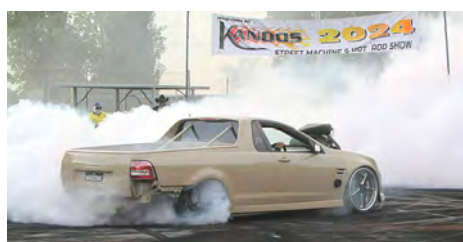
Burnouts were a big favourite again at the Kandos Street Machine and Hot Rod Show. (Photo by Ben Wares Photography).

The Kandos Street Machine and Hot Rod Show pulled off another top event at Simpkins Park on the weekend of January 27 and 28. The show attracted big crowds again this year and most of them were more than happy with a big program including Show n Shine, Go to Whoa, Burnouts and Grass events. Food stalls earned some much appreciated funds and with free face painting and free dodgem cars, kids and their parents were happy. A spectacular Fireworks display topped off a big day on Saturday. Organisers thanked volunteers and sponsors for their support. "Thank you to all those that came from near and far. Thank you to our amazing volunteers for giving up their time to make this event happen. Thank you to our local RFS, VRA and Hospital Auxiliary for helping us all weekend. Thank you to our judges and commentator, and finally congratulations to all our winners, with Dan Mussared in his VK taking out our Best Overall Entrant."