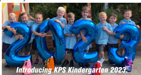
Introducing KPS Kindergarten 2023.

Some good news on NAPLAN results was shared too after it was announced that Kandos Public School recorded the biggest improvement for a primary school in the state's central west with the average Year 5 NAPLAN results increasing by 11.66 per cent over the past five years of NAPLAN.