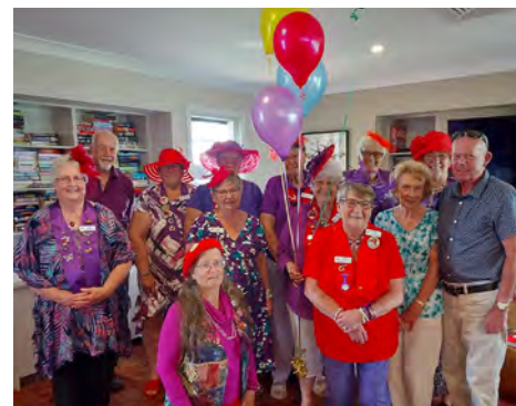
Red Hats having a ball at the Musical High Tea during the Senior's Festival.