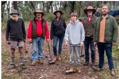
Finalists line up for a crack at the Ted Daniels Perpetual Trophy.