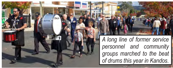
A long line of former service personnel and community groups marched to the beat of drums this year in Kandos.