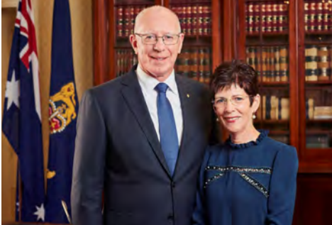
The Governor General, the Honourable David Hurley and his wife Mrs Linda Hurley will visit the Kandos Museum on June 18.