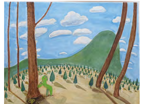
Cactus Fellas Master Stroke.

"As he often said, 'Look at where we live!'"