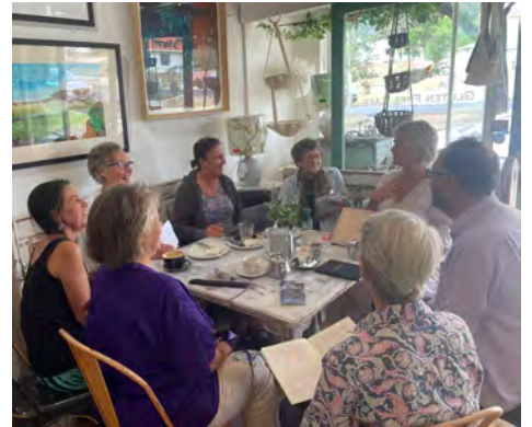
Come and be inspired with fellow writers on Thursdays at The Old Chemist Shop and Gluten Free Cafe in Kandos.