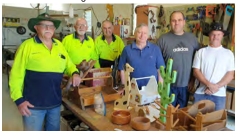
A happy bunch at the Men's Shed with some of their items for sale.

The Kandos Rylstone Men's Shed held their Annual garage sale at their shed on Saturday, November 11. The fundraiser covers some of the costs associated with running their organisation and is a great help to them. Some of the items for sale were hand-crafted by members and other pieces had been repaired or restored and painted by the men. It was a successful day for the team with many visitors calling in for a look and a sausage sizzle.