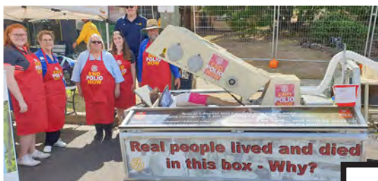
Young Rotaractors from Maitland and Narrabri joined Rylstone Kandos members to lend a hand at StreetFeast. The Iron Lung attracted plenty of interest.

"It was great to see the partnerships which were on display showing how the community across the Rylstone Kandos area and beyond can come together to make such a successful event."