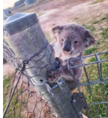
Perched on a post and as cute as a Koala near Mudgee.

A steady stream of sightings in the Lue area indicates that there are critically important Koala habitats in the Central West. Local resident Mick Boller says there have been at least 20 verified recent sightings