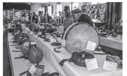
Despite a tough year the pavilion display was excellent and produced some surprisingly large pumpkins and water melons.