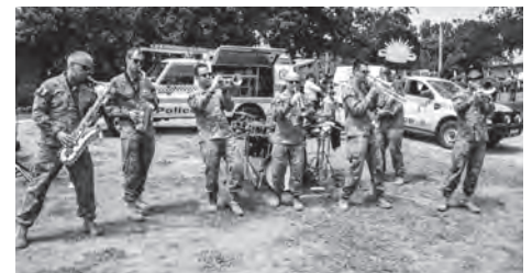
The Army Band drew a big crowd when they got up to play, and they were good.