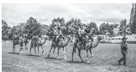
Camel rides were a feature of this year's show and it was a first for many who took the challenge.