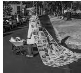
Read all about it! Quirky live-art pieces like this are a feature of Cementa.

from across regional NSW to enjoy the hospitality of the two towns and the brilliant landscape locals enjoy year-round. And of course, to see some art. The festival will once again stretch across town, occupying some of the regular venues like the Kandos Museum, the CWA and St Lawrence Church. It will also reach into