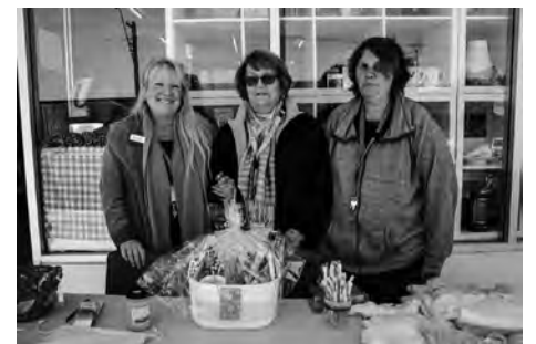
Volunteers rugged up on a cool morning in Rylstone, helping to raise money for the Cancer Council.