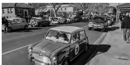
Hundreds of Minis lined the main street of Rylstone during the Rylstone Classic giving viewers an opportunity to stroll amongst them and chat to their owners.

It certainly provides a boost to the region with accommodation booked out and some drivers having to stay as far away as Lithgow. Local service stations, cafes and hotels also did a roaring trade. The Minis departed mid-morning on Sunday, for their annual pilgrimage to Bathurst to experience the holy grail of Australian Motorsport at Mt Panorama and a drive around the circuit.