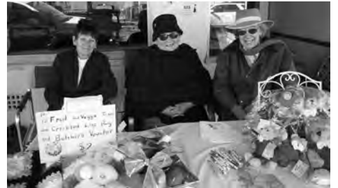
Volunteers rugged up on a cool morning in Rylstone, helping to raise money for the Cancer Council.