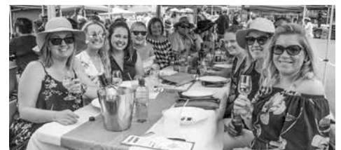
A table of diners enjoying a fun and relaxing day at StreetFeast. Tickets for the Long Lunch are sold out but there's plenty of great food available at pubs, cafés and stalls, and lots of free entertainment all day.

With record numbers of around 430 diners sitting down for the Long Lunch, Rylstone StreetFeast is set to be another great event in Rylstone's main street on Saturday, November 3. Organisers are now concentrating on making the day an enjoyable one for visitors who have opted to partake of the free entertainment while sourcing food at the many other venues for lunch on the day. It's one of the Rylstone-Kandos district's premier annual events allowing visitors to enjoy the scenic beauty of the district, mix with locals and sample the diverse range of local foods, produce, wines, art and craftwork. There'll be over 40 stalls this year for you to bag a bargain. As always, children are most welcome and there'll be lots of activities to keep them happy. Entertainment kicks off at around 10am and there'll be live music centre stage throughout the afternoon. It's a fabulous party in the street and everyone is invited. In addition to the daytime festivities, there'll be live entertainment in the pubs and clubs in the evening until late. Money raised on the day will go to local groups and organisations across the district.