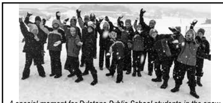
A special moment for Rylstone Public School students in the snow.