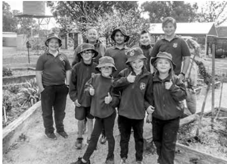
Thumbs up from Lue School students after planting lots of vegetable seedlings in their garden.

Everything has been fed, watered and covered with frost cloth - so fingers crossed, they'll get a bumper crop. Thanks Bunnings - awesome support again.