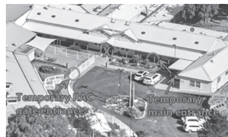
The new temporary entrance to Rylstone MPS.

Rylstone MPS on 6357 8111. The Rylstone MPS Redevelopment project involves extensions and refurbishment to many areas of the MPS, and the addition of a new staff accommodation building. The scope includes new residential aged care rooms and dining area, refurbished acute rooms and improvements to community health. The redevelopment is part of a greater $300 million program of works to upgrade existing or build new MPS facilities in a number of rural and remote communities across NSW.