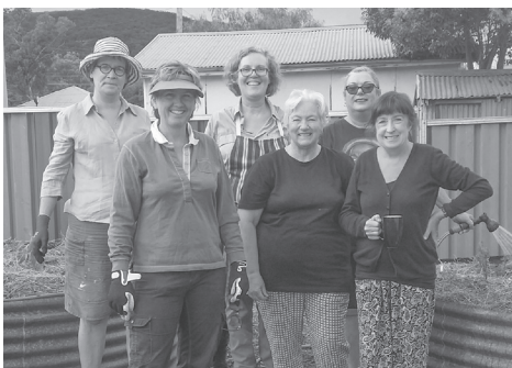
These garden enthusiasts are searching for ideas and like-minded gardeners for the fifth Kandos Gardens Fair in April next year.