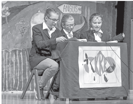
Kandos Public School performers in 'Night at the Kandos Museum' playing journalists at the local community radio station KRR.

Kandos Public School presented their Whole School Performance 'Night at the Kandos Museum' on Thursday, September 7 in a matinee and evening performance to over 500 amazed audience members. In preparation for the performance, students studied the history of the people and places of Kandos and did research about how the main street of Kandos has changed overtime. 'Night at the Kandos Museum' is about the Travelle family who take a spontaneous holiday to Kandos. They make a special visit to the local museum but what happens next is completely unexpected as they make a startling discovery. The tour guide 'Kandice Muzeum' leads the way, but does she