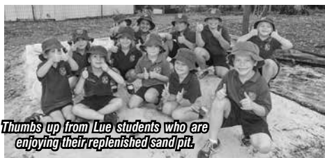
Thumbs up from Lue students who are enjoying their replenished sandpit.