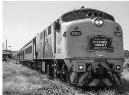
The imposing blue zephyr Rylstone Rocket at Rylstone Railway Station.

Lachlan Valley Railway was originally based in Cowra where it has a museum, but it was left stranded with no rail line following its closure. The group are now relocating to East Fork Depot, Orange where they will have an operational line for its fleet of railmotors and steam trains.