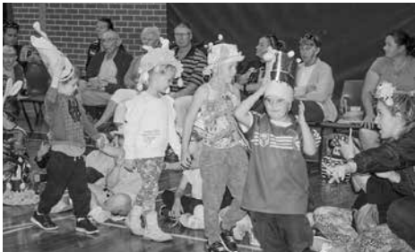
Kandos Public School Students had a fabulous time parading with their colourful hats during the Easter hat Parade.