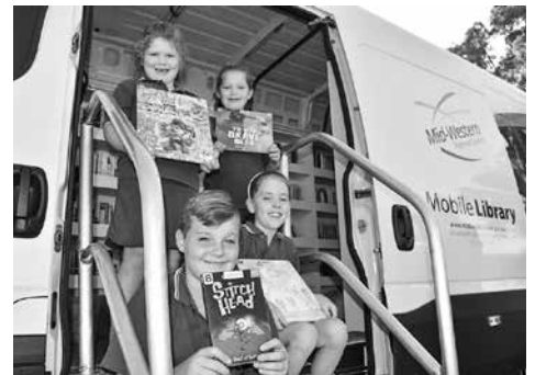
Ulan Public School students enjoying their books from the Mobile Library Van.

The Mobile Library Van operates on a three-week rotation. A schedule of dates and locations can be found on Council's website. Residents who have difficulty in getting to the library may be able to access this service; eligibility is not restricted to age. For more information please call the library on 6378 2740 or email libraries@midwestern.nsw.gov.au