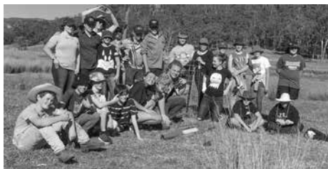
A great effort by KHS students who planted trees in the Capertee Valley to increase the habitat for the endangered Regent Honey Eater.

Kandos High School students recently participated in a native tree planting excursion to the Capertee Valley in support of the Central Tablelands Local Land Services. The students put in an awesome effort and worked very hard planting 60 trees in a number of sites along Glen Alice Road. The trees were planted to re-establish the habitat for the endangered Regent Honey Eater. A big thank you and well done to all those who attended.