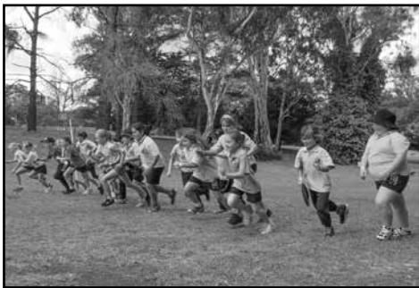
A large group of students from Kandos Public School heading off on their cross country run.

Kandos Public School's annual Cross Country Carnival took place at Henbury Sport and Recreation Club on Thursday, May 10. It was a happy event for students from Year 3 to 6 and some from Year 2, with plenty of smiles and goodwill during the run. Parents turned out to watch and assist staff where they could.