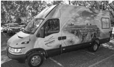
Council's new van catches the eye wherever it goes.

It's scheduled to travel to marketing and promotional activations in the Sydney region in coming months. Locally, the van will be used in the co-ordination of Council events including Flavours of Mudgee and Australia Day as well as attending towns and smaller villages in the region to conduct community engagement and educational activities.