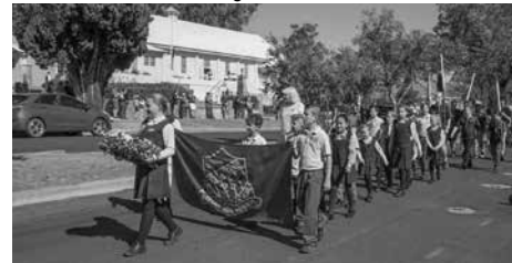
Rylstone Public School students were proud marchers, along with other schools on ANZAC Day.