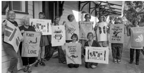
Not your ordinary T-Towel. These stunning designs were created by participants at the Kandos Museum's Screen Printing workshop.